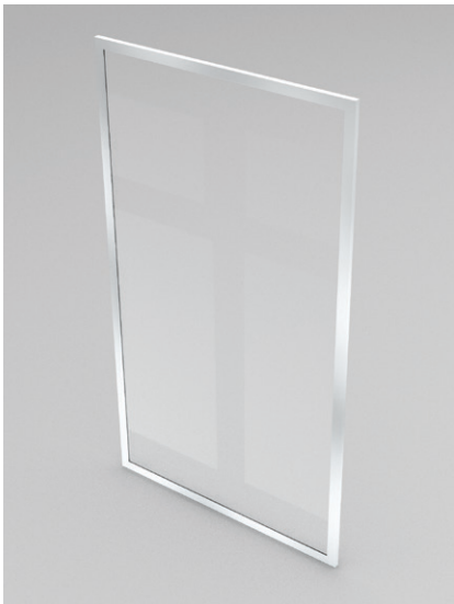
Over Rack Panel